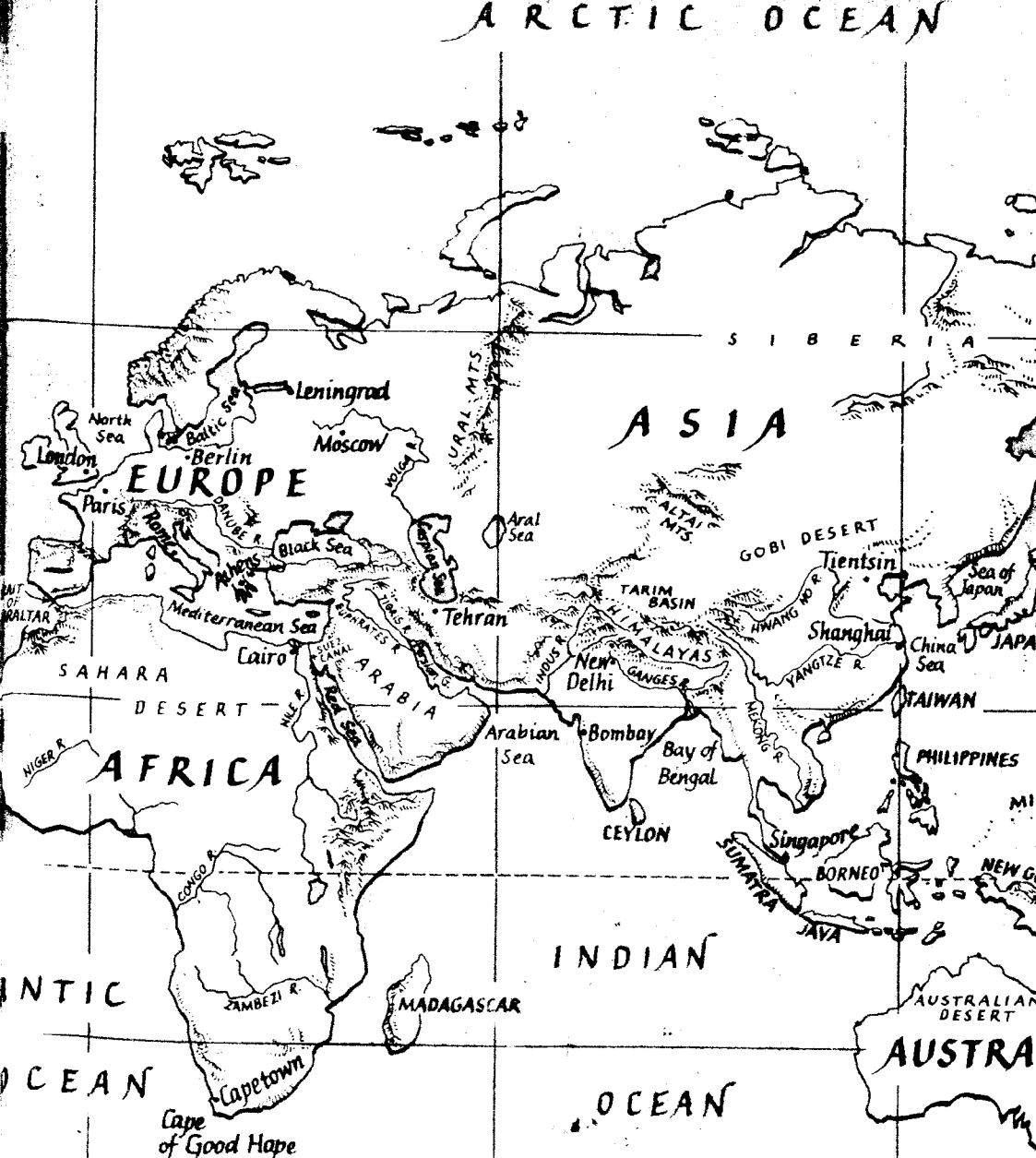
THE WORLD MILLER CYLINDRICAL PROJECTION Scale at the Equator 1:115,000,000