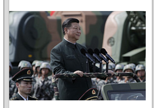
November 15, 2017