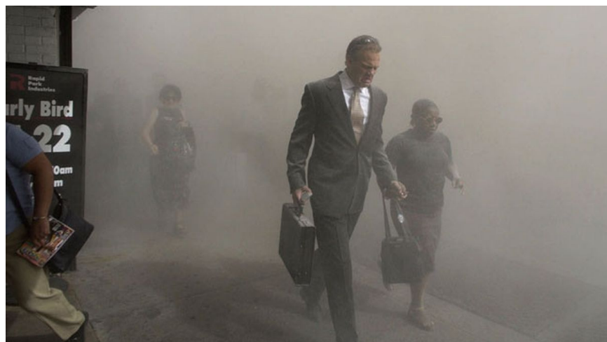
Pedestrians flee the dust-filled area surrounding the World Trade Center. (AAP) ()

However, the true scope of the attack may only start to be understood due to the dust and debris that scattered across Manhattan and Brooklyn.