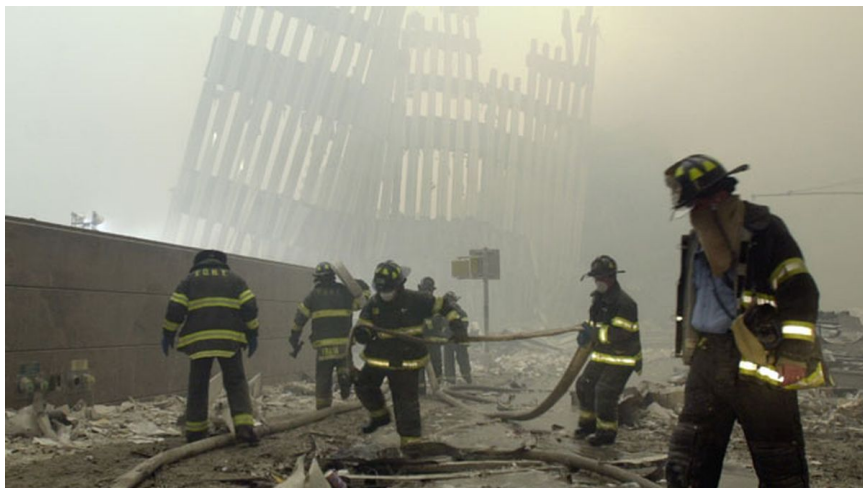
Firefighters work beneath the destroyed mullions, the vertical struts which once faced the soaring outer walls of the World Trade Center towers. (AAP) ()

"They try to influence the population by sowing doubt, saying it's 'not that bad' or that there are 'safe levels' you can be exposed to. That's all BS and lies because they know it will take 20-30 years for it to manifest itself and kill people."