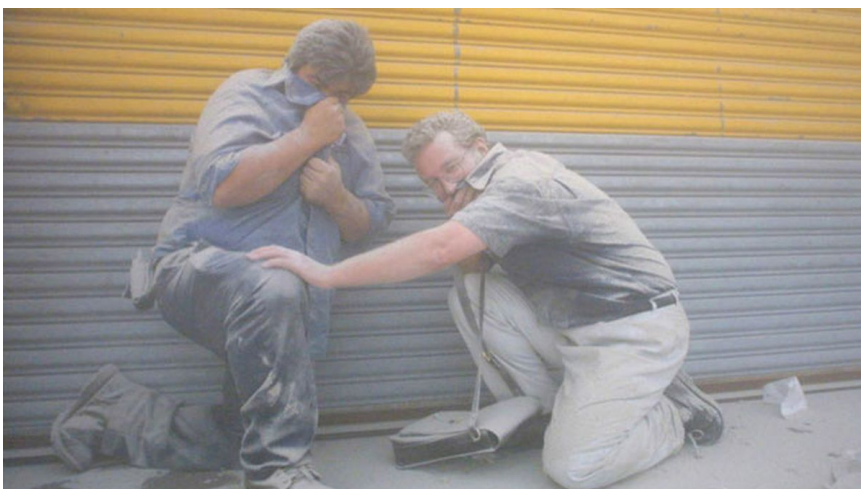
People take cover as a dust cloud from the collapse of the World Trade Center envelops lower Manhattan.

The study found that while an elevated risk for some cancers was demonstrated, there was insufficient evidence to draw a firm conclusion that the cancers were related to exposure.