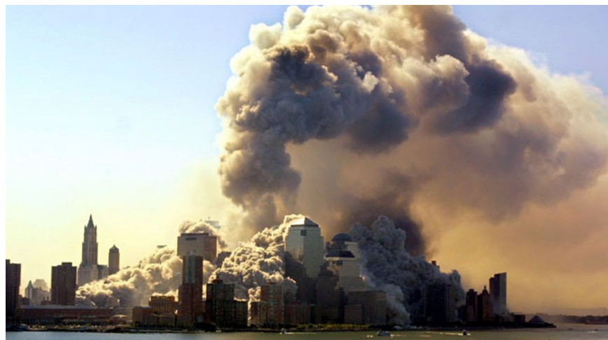
Dust blanketing downtown Manhattan and moving across New York after the twin towers collapsed.