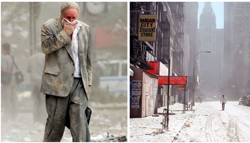
Lower Manhattan was covered in asbestos-filled dust after 9/11 which blew across the entire city and over to Brooklyn.

"It's common sense that what happened in Libby will start happening to the people in New York. That's frightening and it's a big deal," he said.