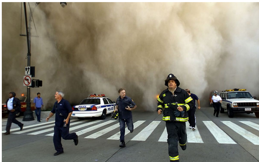
First responders fleeing a dust cloud after the collapse of the World Trade Centre.

started to develop asbestosis and lung cancers.