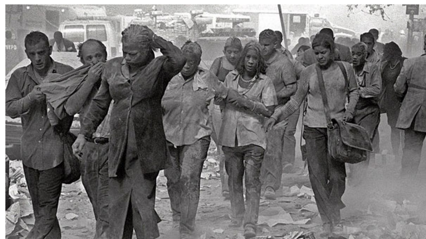
People covered in dust walk over debris near the World Trade Center in New York.