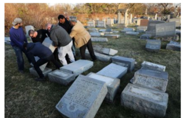
‘Do More.’ Jewish Leaders Are Demanding White House Action