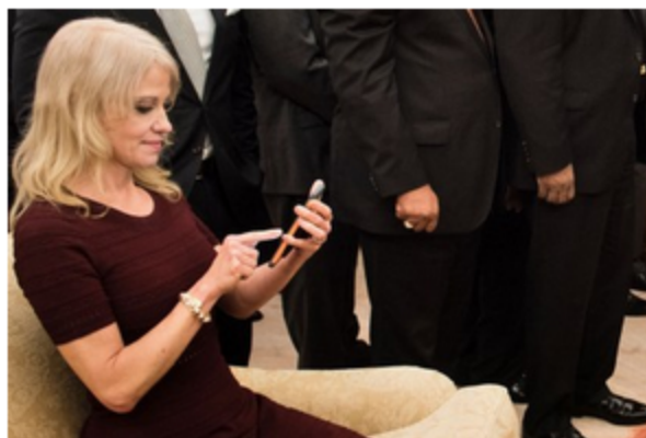
Kellyanne Conway Receives Angry Tweets for Kneeling, Being on Her Phone in Oval Office