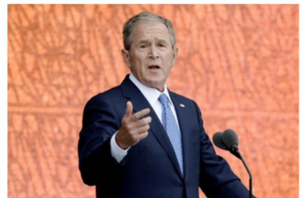
George W. Bush Breaks His Silence on the Direction of the Country Under President Trump: ‘I Don’t Like the Racism and Name-Calling’