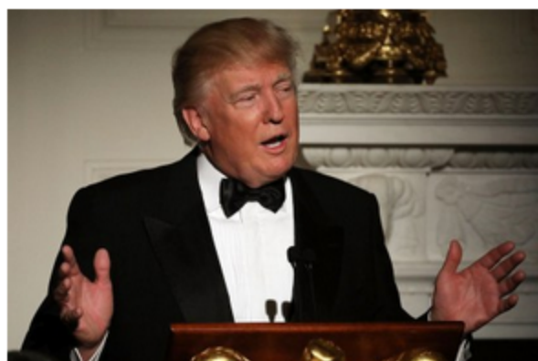
President Trump Claims Oscar Flub Happened Because Hollywood Was