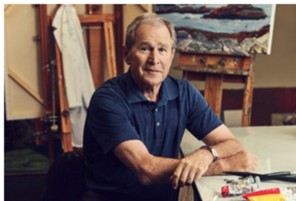
George W. Bush Paints Love Letters to the Men and Women He Sent to War: ‘I Think About Their Troubles and Their Joys’